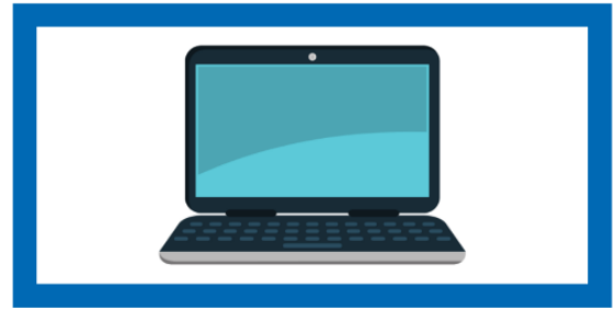
ANDERSON FIVE VIRTUAL ACADEMY